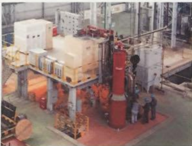
20t电渣炉(20T ESR furnace)