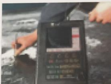
探伤仪(Ultrasonic test instrument)