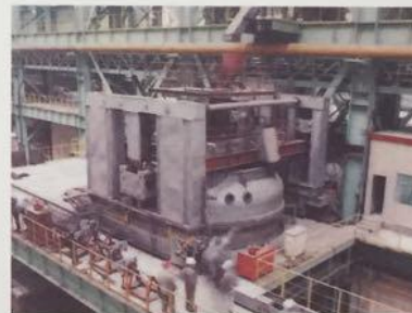
100吨VD炉(100T VD furnace)