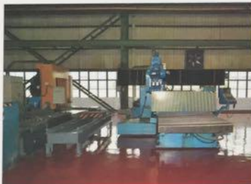
磨床 (Grinding machine)