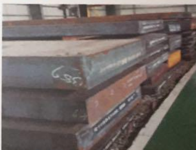
轧制板材 (Rolling plate)