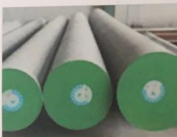
圆钢 (Round bar)