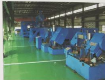
卧锯(Horizontal saw machine)