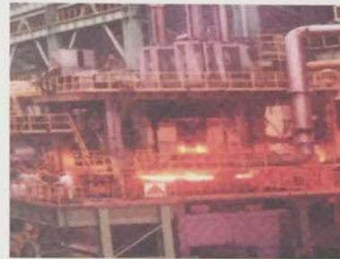
100吨LF炉(100T LF furnace)