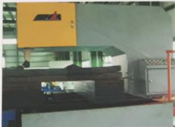
大型立锯(Large-sized vertical saw machine)