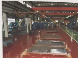
加工车间 (processing plant)