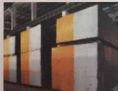
合金模块 (Alloy die blocks)