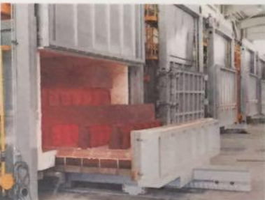
热处理炉(Heat treatment furnace)