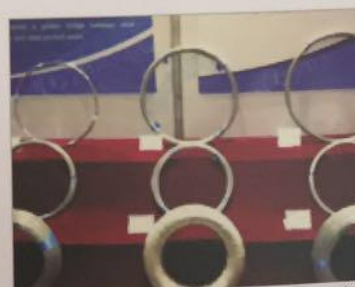
不锈钢盘条 (Stainless steel wire rod)