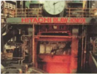
轧机 (Rolling mill)