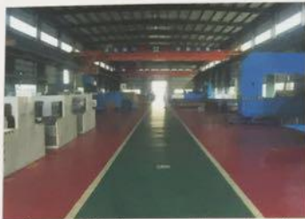
加工车间 (processing plant)