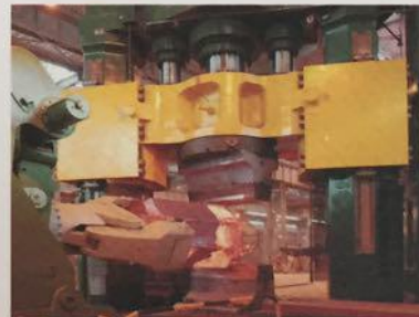
4500吨快锻机 (4500T forging press)